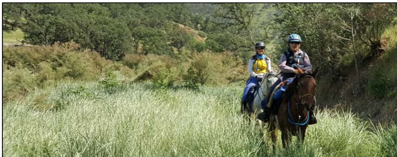
Equestrian riders enjoying a sunny day at the 2017 Annual Cache Creek Ridge Run.

Privately sponsored equestrian and motorized events continue to draw visitors to the area. The Sheetiron 300 Dual Sport Motorcycle Ride occurred on May 20-21, 2017. This event began at the Stoneyford Rodeo Grounds, and traveled along dirt roads in the monument to arrive in Fort Bragg, and back again the next day. The North Bay Sawmill Enduro April 2, 2017 hosted a picnic at Cowboy Camp, and the Cowbell Enduro was hosted on USFS lands.