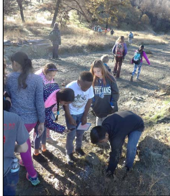
Student field trip to the Cache Creek Natural Area.

Two presentations were made at the Mary Stephens Library in Davis, CA. The first was provided by BLM and USFS staff at the request of the Yolo County Historical Society. This presentation described the monument management planning process and described the type of heritage resource information that historical society volunteers might be able to provide. The second was a presentation made by Tuleyome as part of their “Conservation and You” lecture series. This presentation highlighted some of the trail maintenance work that Tuleyome has done within the monument. Additional public outreach efforts include a boyscout camping trip in the Cache Creek Natural Area, USFS and BLM booths at the Lake County Fair, and fellowship recruitment efforts at the 2017 California Youth Summit.