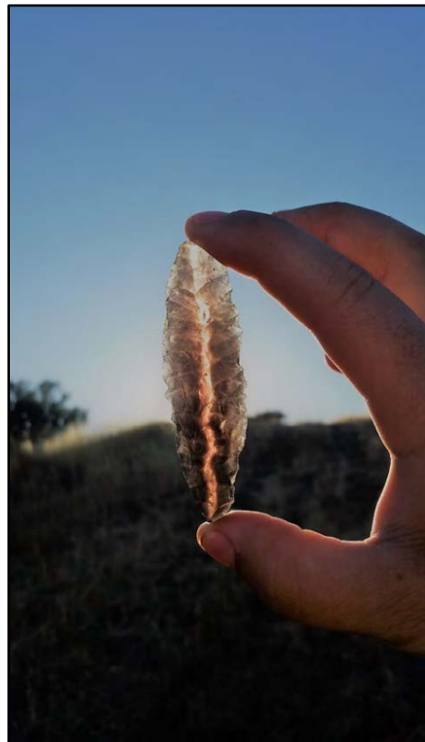
A Yellow Legged Frog and a flaked obsidian tool identified during resource surveys.