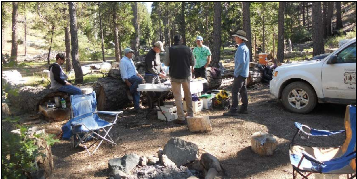
Volunteers gathered at West Crocket Campground to coordinate work for PIT Session 1.

PIT archeological survey projects alone logged 632 volunteer hours but many other volunteer contributions also supported the monument in 2017. Tuleyome coordinated hikes, and offered educational programming. Mendocino 4X4 Club volunteers installed two kiosks to provide information to recreational users in the monument. Hiking, equestrian, and OHV groups all contributed time bushing trails and helping federal agencies offer safe and enjoyable recreational experiences in Berryessa Snow Mountain National Monument.