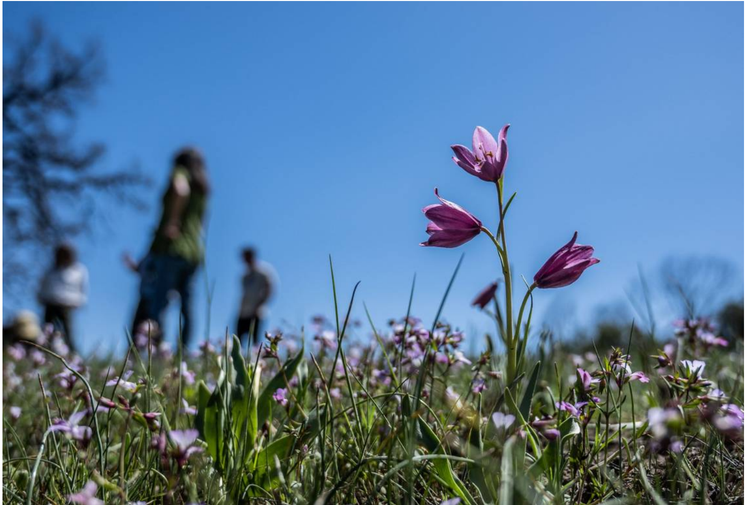
An adobe lily, a rare plant that grows in the clay soils of the Coast Ranges and the low hills of the Sacramento Valley, soaks up the sunshine during a tour earlier this month of Molok Luyuk, which means "Condor Ridge" in the Yocha Dehe Wintun tribal language.

a natural phenomenon deserving of federal protection and stewardship by its indigenous inhabitants.